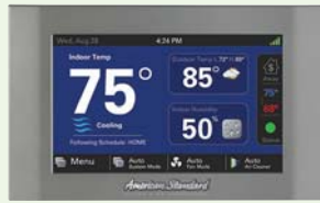
Platinum 850 Control Model No. – ACONT850AC52UA