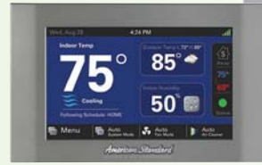
Gold 824 Control Model No. – ACONT824AS52DA