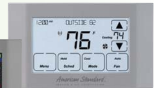
Silver 624 Control Model No. – ACONT624AS42DA