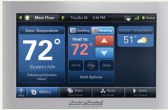
Platinum 950 Control Model No. – AZONE950AC52ZA